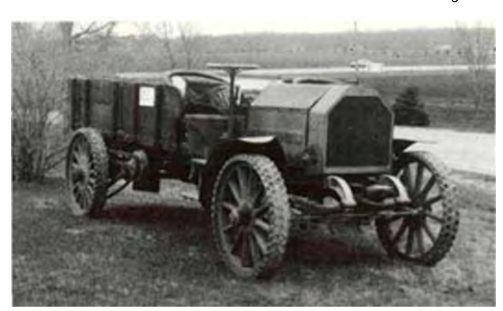
This 1910 Avery truck is all original. This combination truck-tractor had a pulley on front of engine to run belt for a threshing machine. Built mostly for agricultural use.