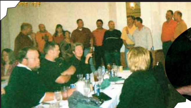
2011 IAR Board is sworn in.