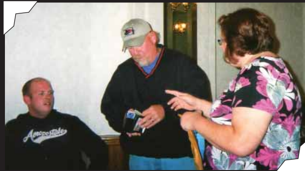
"Get your money out for the 50/50 drawing."