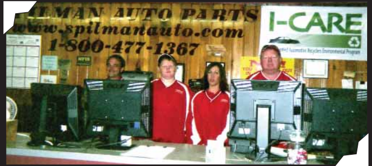
Spilman Auto Parts Staff