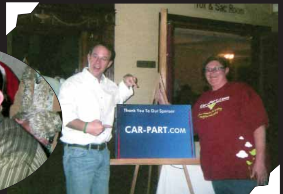
Happy Hour by CAR-PART.com