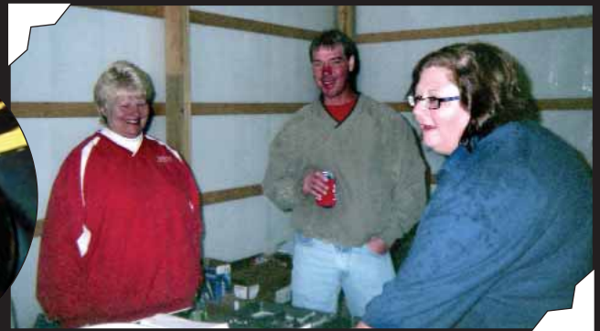
Getting ready for lunch