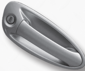
Front Door Handles