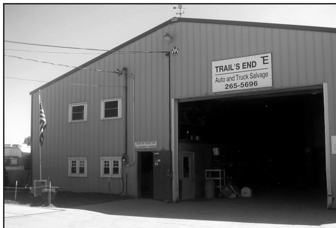
Trail's End Auto & Truck Salvage in Des Moines,